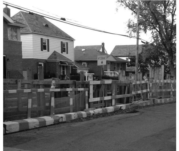
216th Street and 51st Avenue

BAYSIDEHILLSCIVIC@GMAIL.COM FACEBOOK.COM/BAYSIDEHILLS