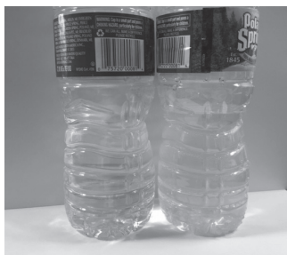
Cloudy tap water