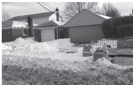
Snowed in for three days