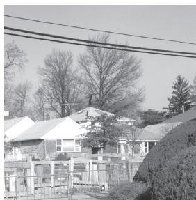
Dec 2015 by my house