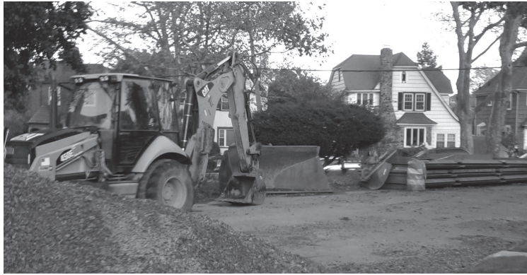
216th Street and 48th Avenue

Red=electrical, yellow=gas, orange=telecommunications, blue= water, green=sewer