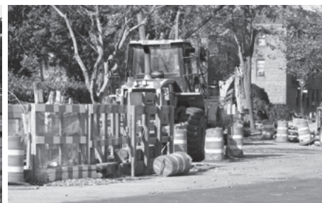
Dermody Triangle November 2016